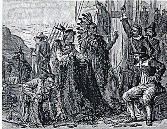
Drawing showing Native Americans trading with the first settlers.

After leaving their homeland in search of new opportunities and freedoms, the English laws angered the colonists. While they had no voice in the laws that were made, they were forced by England to obey the laws, and pay the taxes. Colonists were unhappy and began to speak of independence; at first in whispers, and then in public meetings. Revolution was coming to the North American colonies.