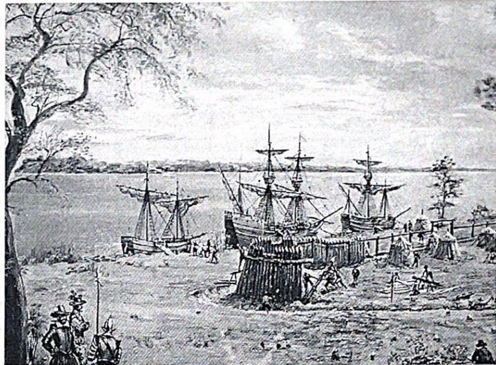
Painting depicting the James Fort construction in May-June 1607.

noticed endless forests and wilderness. People needed food, fresh water, shelter, and safety. Men chopped trees for timber to build log shelters, women searched nearby for edible plants while children chased one another.