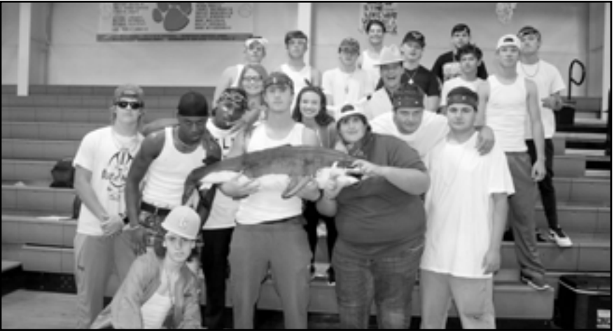
The Kru's Creed: BullshARK.

extremely embarrassing attire to fit every theme. To go along with each theme, they play music through a speaker that they bring to every home game. Country Roads is always played to bring the spirits up of everyone in the gym.